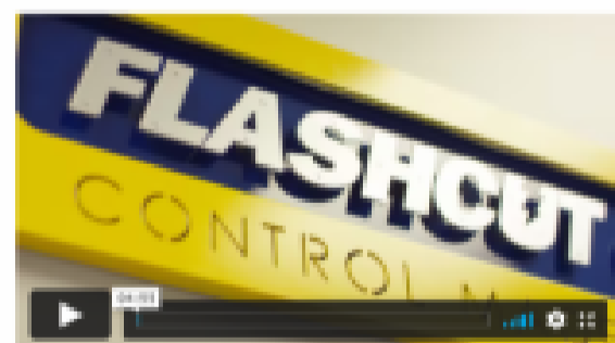
FlashCut CNC Company Video