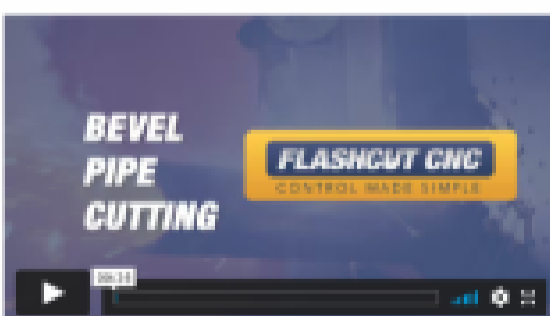
Plasma Bevel Cutting for Pipe

We have a series of new videos including pipe cutting, torch height control and an overall company video. They are featured on our homepage.