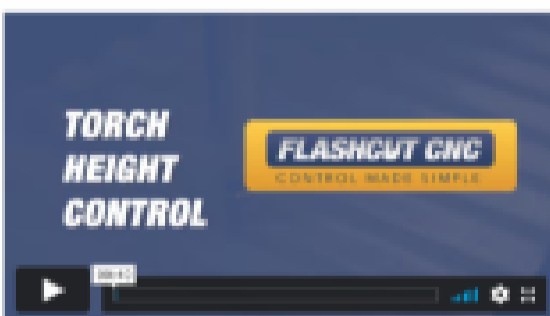
Singray Torch Height Control