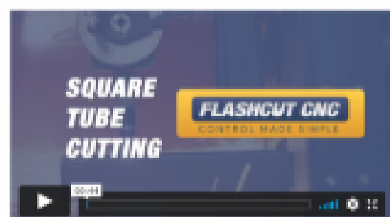
Square Tube Cutting and Design